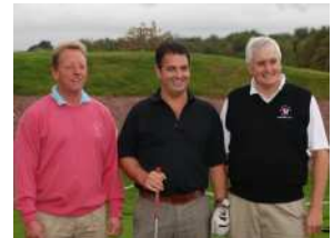
Mr. Captain's Drive In.